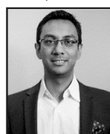
Mynul Khan Field Nation