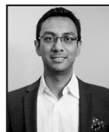
Mynul Khan Field Nation